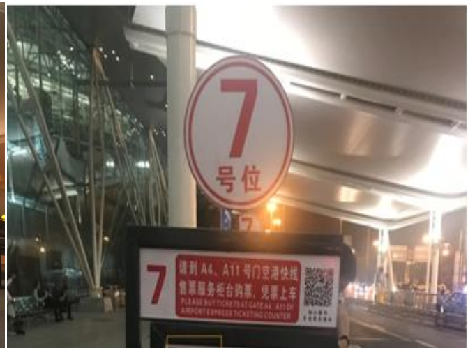
No.7 bus station instruction in front of Gate A1