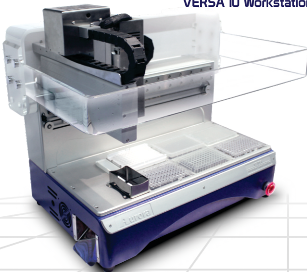
VERSA 10 Workstation