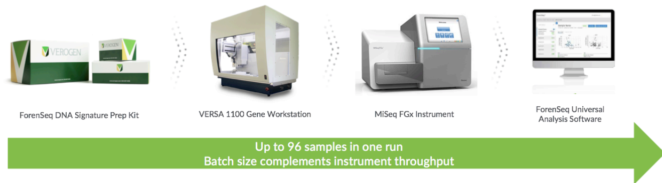
Figure 1: The Verogen MiSeq FGx ® Forensic Genomics Solution using the VERSA 1100 Gene. Beginning with post-PCR processing, the pre-programmed VERSA 1100 Gene creates sequencing-ready libraries with minimal user input. The Illumina MiSeq FGx sequencing instrument and ForenSeq Universal Analysis Software complete the workflow with intuitive set-up guidance and semi-automated data analysis.

Verogen and Aurora Biomed have partnered to automate library preparation using the ForenSeq DNA Signature Prep Kit on the VERSA 1100 Gene liquid handling robot. The VERSA 1100 Gene Workstation is designed to smoothly handle post-PCR processing for up to 96 samples simultaneously, with the precision and accuracy needed for smaller runs as well. This flexibility complements the practical batch sizes needed in the forensic genomics laboratory: high capacity for databasing or backlog reduction, and smaller throughput for casework and other applications.