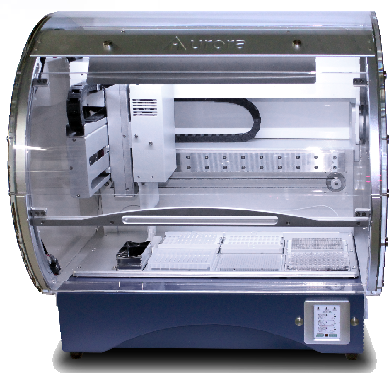
Figure 1: VERSA 10 Workstation with HEPA / UV enclosure

A major challenge in automated PCR technology is efficiently scaling up to high-throughput PCR using microlitre volumes of cDNA samples while also ensuring low cross-contamination and high accuracy and reproducibility. Aurora Biomed Inc. has recently launched its VERSA 10 PCR Setup Workstation (Figure 1) as an answer for accurate and reproducible high-throughput PCR. In this work, real-time PCR setups for 2 trout fish genes (SF10 and SF1a) were configured using Aurora Biomed's VERSA 10 Workstation to dispense 1 or 2 \mu L-volumes of cDNA template into an alternate column to check for cross-contamination. The statistical analysis from the replicates and inter-channel capabilities indicates that each of the channels reproducibly dispenses accurate volumes along the deck while conditions generate amplicons of the same size, making the VERSA 10 PCR Setup Workstation an excellent alternative for high-throughput and real-time PCR.